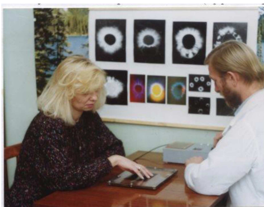
Figure 2. Biodiagnostics.

On basis of GRV method – it is possible for gas-discharge