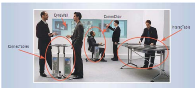
Figure 2. Roomware (2 nd generation), Design [3].

Here it has presented four components of i-LAND which are: DynaWall, CommChair, InteracTable and ConneCTable [3].