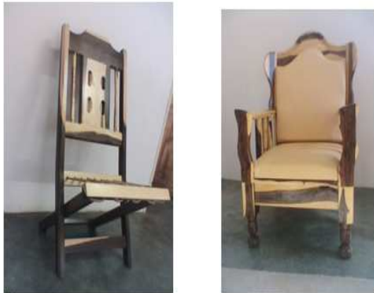
Figure 1. Chairs from a local industry made from Acacia burkea (left) and Spirostachys africanawood (right).

ure 1. Very little is known about properties of timber that is processed and used in local workshop.