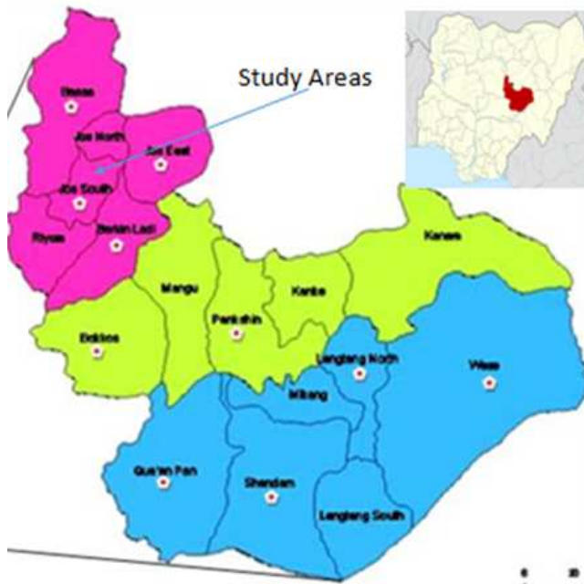
Figure 1. Location map of study areas

This study assesses farmers' knowledge on the effect of climate on growth and yield of potato. Jos- South-Local Government Area of Plateau State Nigeria is one of the seventeen local governments in Plateau State. It is made up of four districts: Vwang, Du, Gyel, and Kuru. The local government area has its headquarters in Bukuru. It lies on latitude 8° 43° N and longitude 8° 46° N with an altitude of 1293.2m above sea level. The local government area is bounded by Barkin- Ladi local government to the South, Riyom local government to the South West, Jos-East local government to the East and Bassa Local Government to the West (Figure. 1). The local Government has a population of 650,835 (National population Commission, 2006) with an average land area of 1,037km 2 .