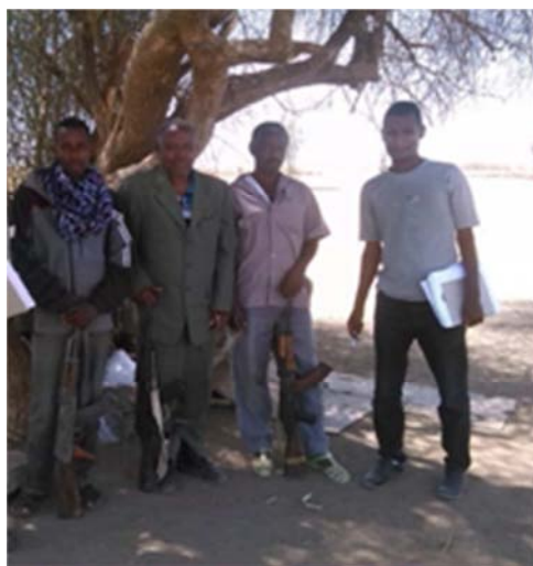
Figure 5. The local security on their checkpoint site near humera.