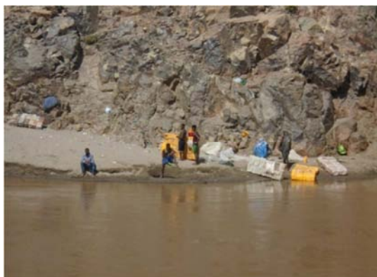
Figure 4. Illegal traffickers with their traditional boat on Eritrea and Sudan side.

Investors; There were different types of investors in the boarder of the study wereda. To list some of them; cereal farming investors, animal fattening investors, importers and exporters of goods. These investors were not all absolute in struggling the illegal plant genetic resource. There were investors that exports unpermitted goods, biological resources together with the legal one by cheating the legal routes. This was from the experience of local security and other legal concerned bodies and the researcher observation. Therefore biogenetic resource trafficking were not that much a single line that perform by a single person, group or community rather it was a complex Phenomena remain difficult to control completely in the study area.