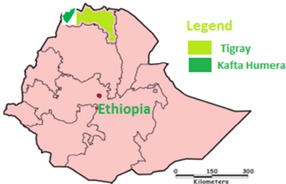
Figure 1. Map of Ethiopia indicating the study site.

Figure 1 below. kafta Humera wereda surrounds Setit Humera , capital city of Western Tigray Zone, kafta Humera and Setit Humera Weredas , in all sides. People in the study area lead their life by a mixed farming system (animal husbandry and crop farming).