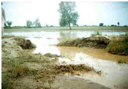
Fig. 3. Unmanaged Non perennial spate irrigation

The weir was constructed to divert spate flows to upstream fields. It performed this function, but it also considerably reduced the base flow to the downstream fields' which caused many tensions and conflicts. As conflicts became unbearable, the two communities (upstream & downstream farmers) reached a mutual agreement: they purposely blew up the weir (Fig. 5) and returned to their indigenous structures and water-sharing arrangement.