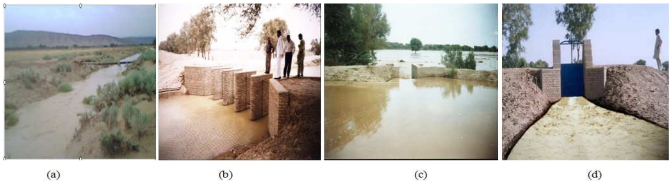
Fig. 7. Development of hill torrent structures made by PARC

The cultivated fields in Rod-Kohi irrigation System are large to the extent of 8 - 10 acres or more. The water application to the fields is crucial to control water in the flood season. Cost effective water application structures of