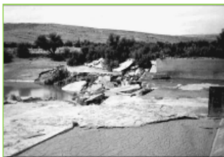
Fig. 5. Deliberately destroyed weir in Anambar Plain