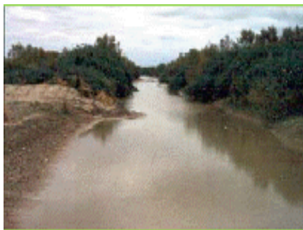
Fig. 4. Managed Non perennial spate irrigation