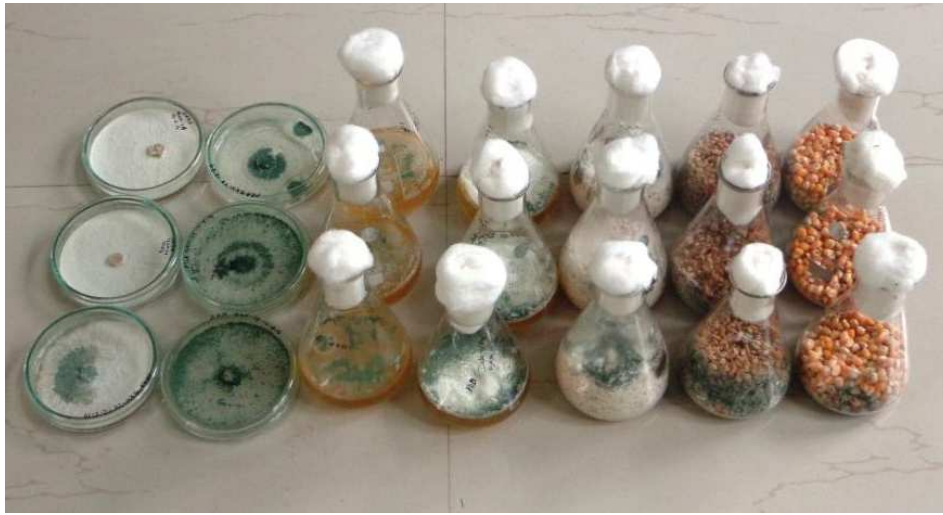
Figure 2. Mycelial growth and sporulation on different media and food grains.