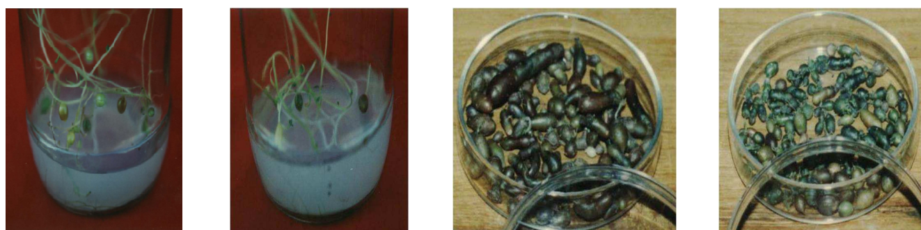
Plate 2. Number of microtubers at two months of explantation under different treatments.