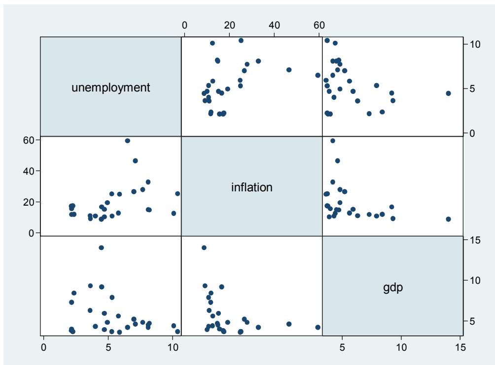
Figure 1. Graph matrix of unemployment, inflation and GDP.

A scatterplot matrix of unemployment against inflation rate and GDP growth rate is plotted to identify non-linearities and outliers' problems in the data as shown in Figure 1.