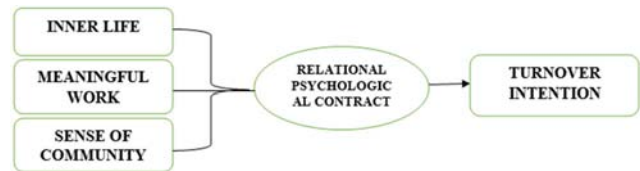
Figure 1. Model for the Study.

Consequently, the present study has adopted this theory to underpin its model as shown in figure 1.