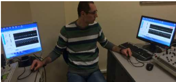
Figure 1. Simultaneous PPG signal recording from the left and the right index fingertips of a male volunteer.

The PPG signals recorded from a male volunteer is considered for demonstrative purposes (see Figure 1). Figures 2a and 2b show the signals recorded from the left and the right fingertips, respectively. Figure 3 shows the power spectral density spectrum computed for the signals. On these plots, two peaks are noticeable close to 1.2Hz and 2.7Hz. For the left fingertip PPG signal, the signal power estimates are 4.08, 3.77 and 0.31 for 0-4Hz, 0-2Hz and 2-4Hz frequency bands, respectively. Right fingertip PPG signal powers are estimated as 6.29, 5.34 and 0.95 for 0-4Hz, 0-2Hz and 2-4Hz frequency bands, respectively. From the left fingertip signal, SD1, SD2 and SD1/SD2 indexes computed are 2.14, 1228.70 and 1.00, respectively. SD1, SD2 and SD1/SD2 index values are 2.16, 1228.50 and 1.10, respectively for the right fingertip.