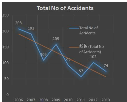
Figure 1. Total Number of Accidents and their Trend.