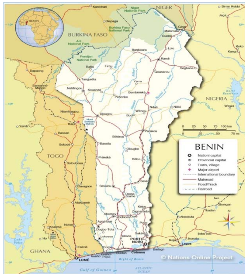
Figure 1. Road network of Benin Republic.

Though Benin Republic has superior location advantage, its economic foundation is very weak [12]. The formal transport sector contributes approximately 7 percent of GDP. Agricultural structure lacks of adjustment, the development of secondary industry is restricted and the tertiary industry just starts [13-15]. All these obstruct the whole country economic development.