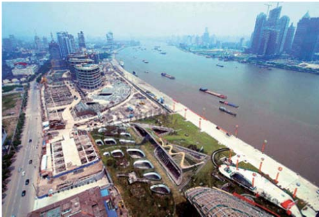
Figure 1. Huishan old port before transformation.

Throughout the experience of shipping centers in other countries and regions, the construction of well-known shipping centers such as London, New York and Singapore has undergone the transformation of old port districts and service upgrading. Given Shanghai’s actual situation, the old port area named Huishan, located at the North Bund along the Huangpu River, is facing such a historical moment. (See Figure 1.