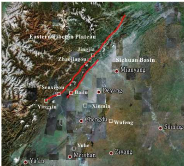
Figure 2. Regional river basin distributions (Jianjin Cao, et al. , 2017).

Wenjiaba Lake area is complex geological structure along the Ping Tong Town - Nanbazhen North East trending with the central north section of Longmen Mountain Fault Zone, and Pingwu - Qingchuan fault zone. The fault block area between the central fault Zone of Longmen Mountain and the fault zone of the front mountain is composed of Silurian and Devonian. NO.II - Ping Tong Town - Nanbazhen North East fracture belt and Pingwu - Qingchuan fault zone by the clamping block. The southwest segment is mainly composed of Silurian, and the northern part consists of metamorphic strata of Nanhua to Sinian system, which is the main shock zone of Wenchuan earthquake.