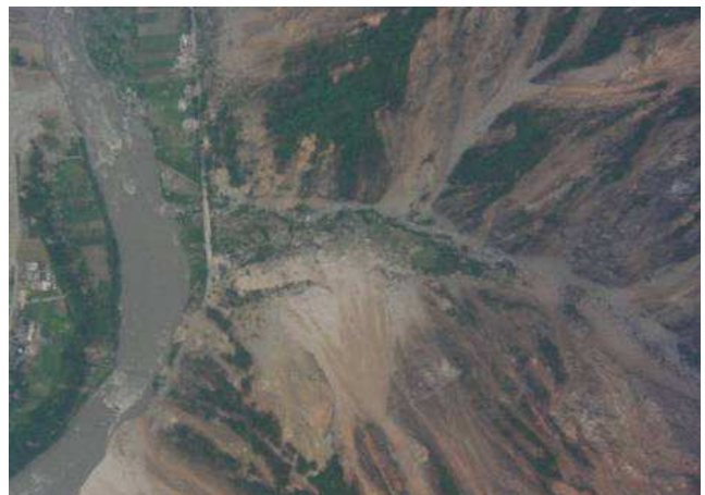
Figure 1. Mizoguchi earthquake aerial remote sensing images (2008. 05. 26).

A large number of beng accumulations have been accumulated in the channel after the earthquake gully. In December 2008, the situation was studied, and the average thickness of Mozigou accumulation of debris flow fan is about 30 meters. The accumulation body side is about 1 million and 500 thousand m^3 (Figure 1). A large number of deposits decline in water, resulting in river blockage, the formation of lake.