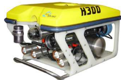
Figure 1. ROV System.

depths. Signs of deterioration/ defect could be seen at few locations. In masonry, the pointing is intact on all over the places where images were captured. The mortar in rubble masonry is not missing in the observed locations. Cracked mortar was not visible. Cavities could not be detected. Algae growth was visible in many places [9] [10]. The concrete portion of the trash racks, that is the slab and columns are generally intact at all depths. Grouting marks could not be observed in the masonry portions. ROV could not be piloted below 530ft elevation due to wooden debris or other obstructions (Figure 3 & 4). In front of the trash racks and at the bottom of masonry portion, wooden branches as debris were visible in many places (Figure 3). Heap of stones were found at EL 522 ft inside the trash racks (Figure 4), which is above the invert level of the inlet of the penstock. No other defects were seen in trash racks. The cross section of the horizontal member of the trash rack looks like I section and the vertical member rectangular. In this I section, stones were found lying at many places in the horizontal members (Figure 5) [10].