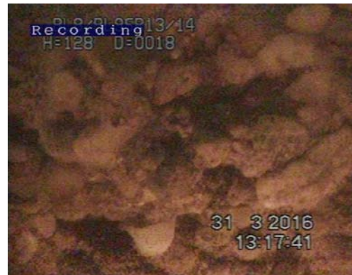
Figure 8. Honey combing in concrete between SB13 and SB14 at EL 556ft.