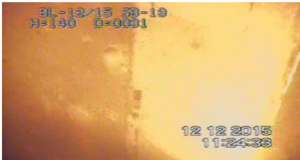
Figure 10. Reflecting portion in gate groove of SB19 at EL523ft.