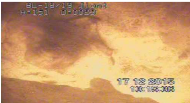
Figure 11. Grouting marks seen at EL549ft. On Block 18/Block 19 Joint.