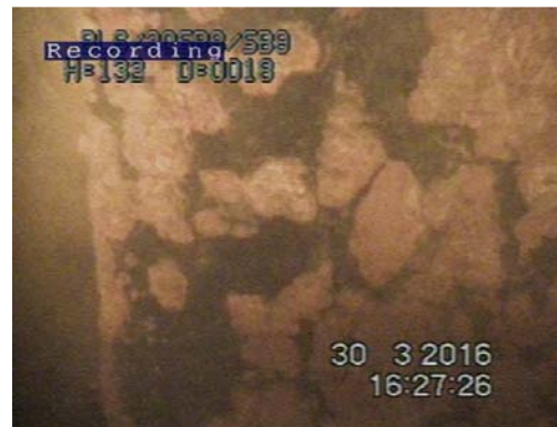
Figure 9. Anomaly on the left gate guide of SB9 at EL 556ft.