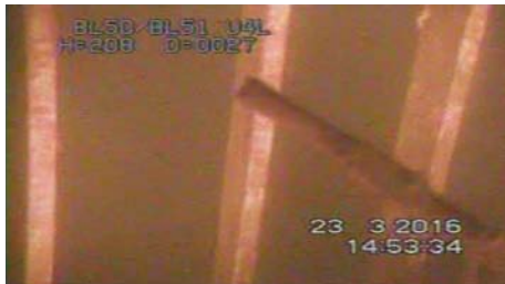
Figure 3. Wooden debris obstructing the downward movement of ROV at EL 528ft.

No anomaly can be seen on the locations on the gate groove where it comes in contact (Figure 10) with the rubber seal as the portion where the seal is coming in contact with rubber seal of gate groove is always clean and getting good reflections of light (Figure 10). Good concrete could be observed at many locations even at the deepest as well as at the shallowest levels (Figure 12). Previous intact grouting marks could be observed in many locations (Figure 11).