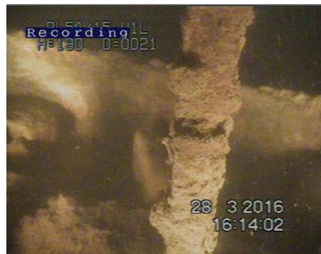
Figure 5. Stones found on horizontal members of left trash racks in Unit 1 at EL547ft.