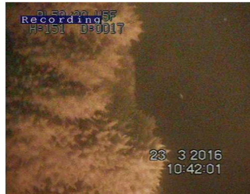
Figure 6. Heavy growth of algae on the vertical members of trash racks of Unit 5 at EL 561ft.