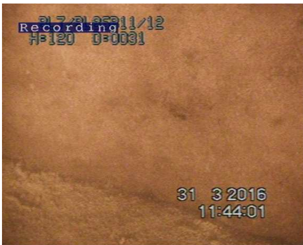
Figure 12. Good concrete at bottom of gate groove of SB 11 at EL513ft.