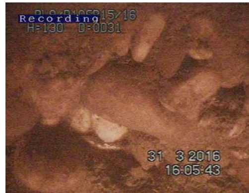
Figure 7. Honey combing in concrete between SB15 and SB16 at EL 513ft.