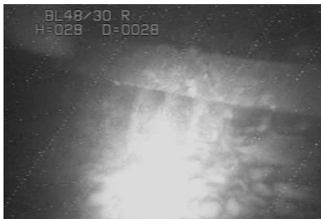
Figure 4. Boulders and pebbles found at EL 522 inside the trash rack of Unit 6.