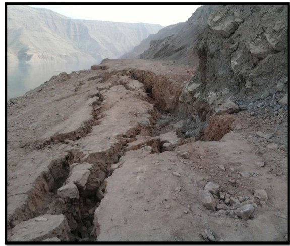
Fig. 3. cracking in the embankment after dam impounding.

Concerning the results obtained, reviewing the prepared photos and according to the opinion of experts engaged in the project, the quality of soil was evaluated as somehow mid to low.