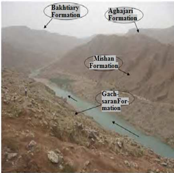
Fig. 1. Location of dam's reservoir foundations.

The dam reservoir, being longer than 90 km, is surrounded by Aghajari, Mishan, Lahbari, Bakhtiyari (conglomerate, Figure 1)