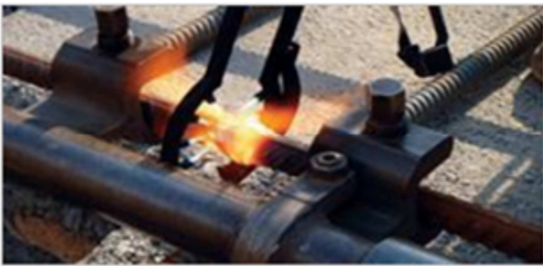
Fig. 5. Head to head forging welding.

This technology was invented in 1952, having the aim to use in the rail transportation industry. Over time, it is expanded into the construction industry due to its advantages (Fig. 5) [16].