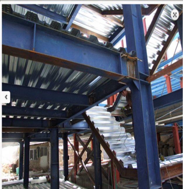
Fig. 2. Galvanized sheets used in temporary pillar in the Midspan.

of using the metal deck plates is in the condition of severe wind blowing (before connection of structural elements). With considering time and cost criteria, we can mention the following points: