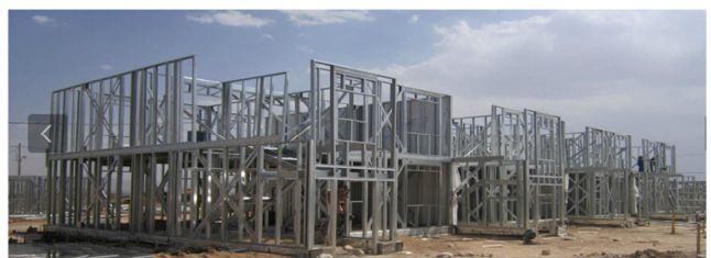
Fig. 4. Light weight steel.

Lightweight steel (LFS) frame (Fig. 4) is made from cold rolled steel sections [11]. Using of this system is one of the suitable ways to build additional floor in the structure. The main components include cold-formed galvanized steel profile that are shaped in Z, C and U sections. These components are used horizontally or vertically and at specific intervals and also self-dilling screws or nuts and bolts are employed for connecting them. [11]