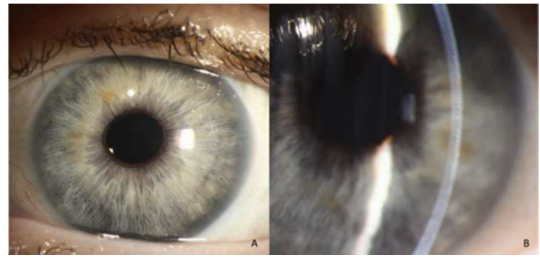
Figure 2. A. Right cornea demonstrating resolution of punctate epithelial keratopathy and B. anterior basement membrane changes. Findings in left cornea also resolved (not shown here) (Photos courtesy of Stephen E. Orlin, MD).