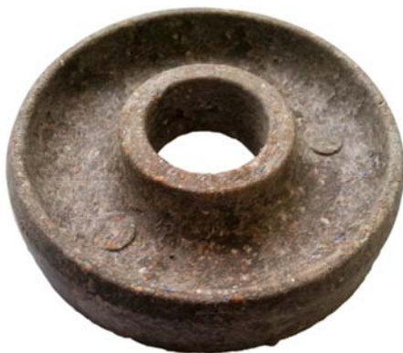
Figure 1. Core plug used to protect paper mother rolls during transportation.

Products of different shapes, such as roof tiles, edge protectors or core plugs, are also common.