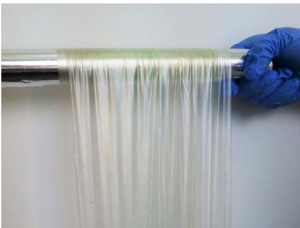
Figure 8. LDPE derived from PE-Al by solvent extraction could be successfully used in blown film extrusion process.

Al separated from the LDPE solution along with other solids may contain up to 60% by mass of residual solvent that will require drying. Additional wash with fresh solvent enables reduction of residual LDPE content. Depending on PE-Al purity, produced Al can contain different levels of organic carbon contamination. Such product before re-melting into ingots will usually require additional treatment, by such means as pyrolysis.