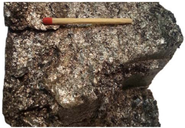
Figure 4. Solid product of pyrolysis process. Composition: 42,9% C; 36,9% Al total ; 17,7% Al met .

Although by means of pyrolysis some material recycling can be achieved, all PE is lost in this energy consuming process.