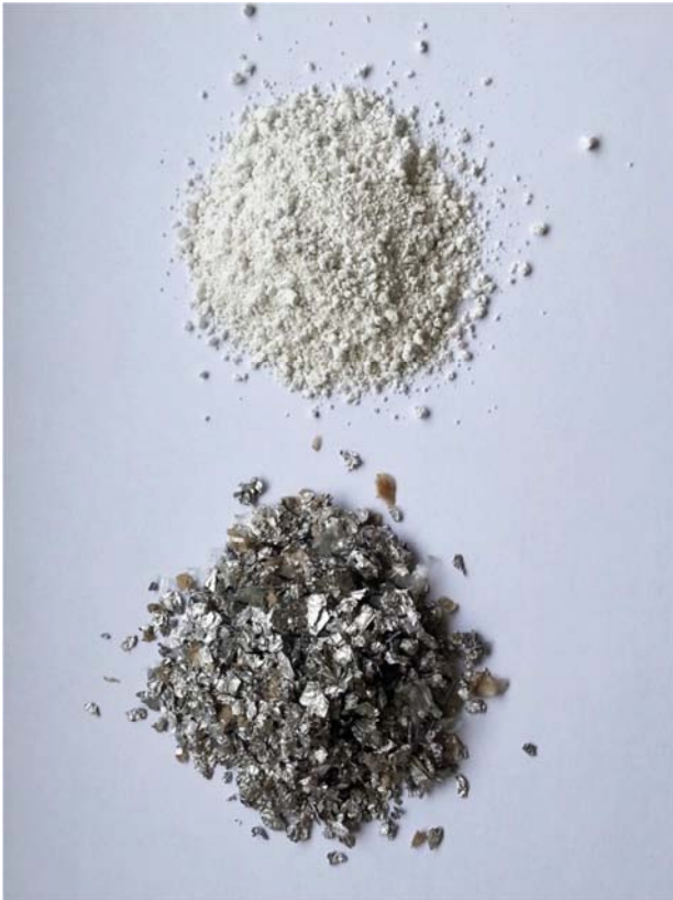
Figure 7. End-products obtained from PE-Al laminate by solvent extraction process: nearly white LDPE powder (top); aluminium based fraction: 59,9% Al_{met} , 0,9% Al_{ox} , 35,2% organic impurities such as paper, PET, residual LDPE etc. (bottom).

evaporator) are used most commonly for polymer drying as such equipment can operate in a continuous action and is far less complex than technologies such as spray- or vacuum-drying. On the other hand, thin layer evaporator requires high temperatures to operate with highly viscous solution. Full removal of solvent is usually problematic, and polymer degradation due to high temperature gradient is not something unheard-of. Lowering the quality of LDPE product could result in impaired economic performance, as the Al is produced in lower quantity.