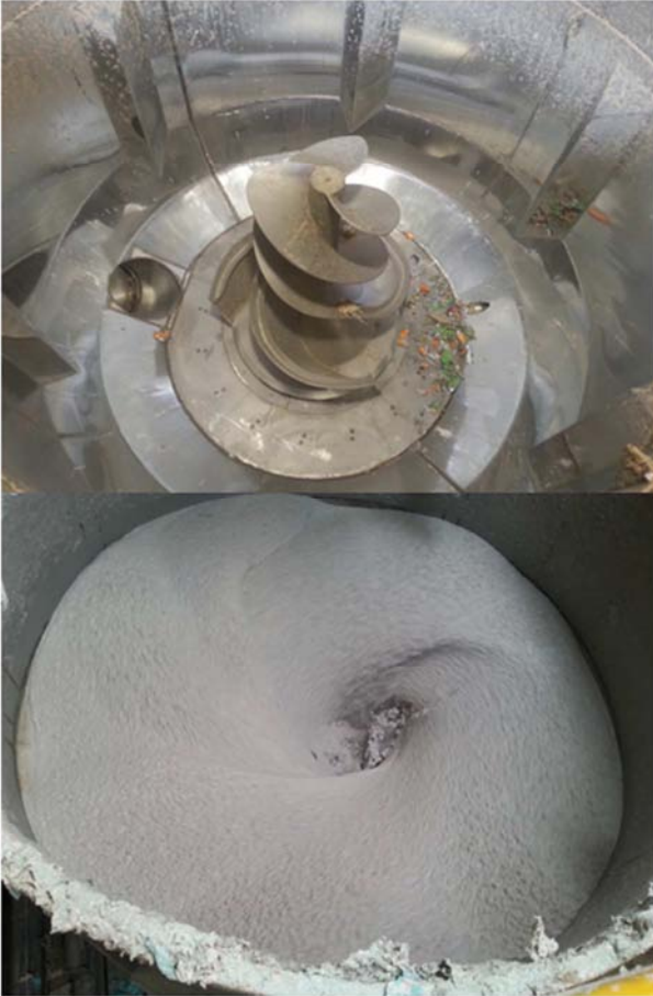
Figure 3. Vertical type hydrolpulper: empty (top); during UTPC processing (bottom).

fuel is free from elements: S, N, F, Cl, Br, P. [3] On the other hand, cement industry in Europe has reached its limit in terms of refuse-derived fuel (RDF) consumption forcing pulp industry to direct PE-Al to landfill sites or to search for alternative solutions like pyrolysis.