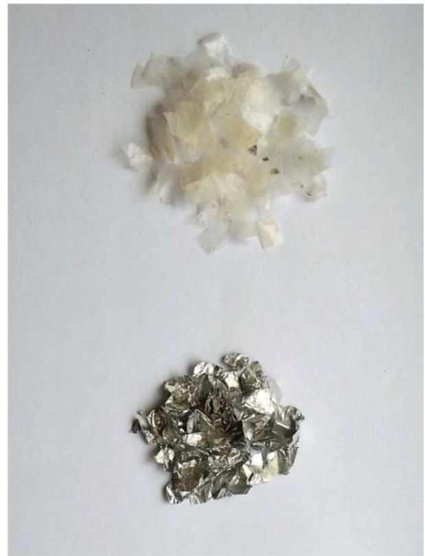
Figure 6. Products obtained from PE-Al laminate by delamination with 20% formic acid at 40°C: LDPE flakes containing some Al contamination (top); aluminium based fraction (bottom).

Using solvent as a delamination agent is also a viable option, although to the best of authors' knowledge, no such technology has left the pilot stage yet. Solvent usually comprises mixed hydrocarbons with boiling point, low enough to facilitate efficient drying. Sink-or-float process is not an effective separation method in case of most solvent mixes as organic solvents usually do not have density high enough to float PE. In some cases, solvent mixtures containing water in separate phase can be used as efficient delamination agent while Al and PE separation might be achieved on phase boundary. [12]