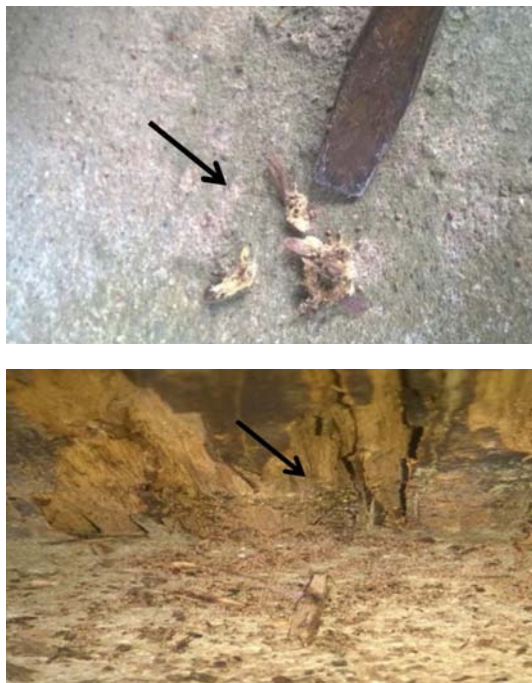
Figure 3. Wing termite and head of worker termite died at position of wooden pillar at house on stilts of Tan Da Resort.

The results in Figure 2 shows that at the time of treatment, the quantity of drywood termite feces discharged at the wooden dividing wall was more than that in 2 other groups in that structure. The quantity of termite feces was the least from the collar beam group at before and after treatment. One day after treatment, the quantity of termite feces at all treatment positions decreased (decreased on average 8.6 g/structural element in comparison to before testing). The quantity of termite feces continued to decrease (on average 14 g/structural element) after 3 days of treatment. Five days after treatment, there were no feces of drywood termite at treatment points. Meanwhile, in comparison, the quantity of feces was slightly reduced but increased gradually after testing. For the measure on injecting Cislin through the knock-out holes, the quantity of discharged feces was reduced in comparison to the periods 1 and 3 days before testing on average, 6.3 g/structural element after treatment. The efficiency of injecting Cislin against the drywood termite was 17.5% after 5 days which indicated that the colony was reduced but not eliminated (Figure 2). Meanwhile the injecting, covering, and binding treatment achieved 100% efficiency after 5 days.