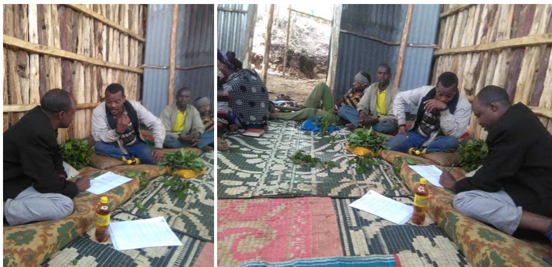
Figure 2. Researcher during focus group discussion.