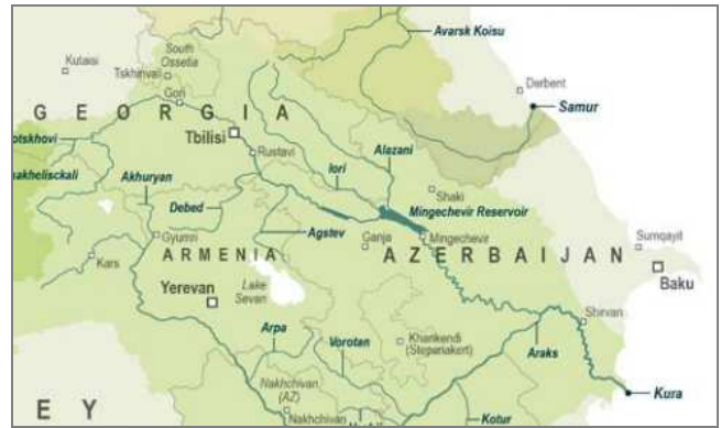
Figure 1. Georgia's trans-boundary surface waters

Information on groundwater resources in Georgia is sparse, due to very limited hydro-geological monitoring data. Groundwater monitoring in Georgia stopped in the early 1990s, therefore estimates on groundwater reserves largely date back to the 1970-1980s. It is assumed that only about one third of the “known” groundwater resources have been surveyed in detail, and that total groundwater resources are estimated to be 18 BCM with 67% in Western Georgia and 33% in Eastern Georgia [1].