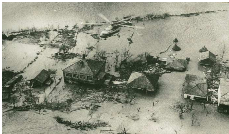
Figure 2. Catastrophic flooding on River Rioni on 31 of January, 1987 at vil. Chaladidi.