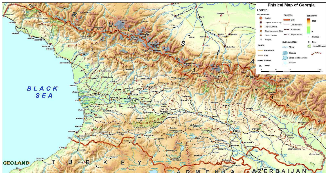
Figure 1. Map of Georgia.

Ajaristskhali is characterized by the biggest intensity of river water maximal discharge drop ( a_{Qm} = -2,95 ), while the biggest intensity of growth ( a_{Qm} = 35,5 ) is observed at village Saqochakidze, river Rioni. Multi-year dynamics of maximal discharge of these rivers with relevant trends is given in the fig. 3.