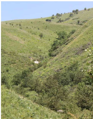
Figure 5. General view of Azat IPA

IPA is located at the transition boundary North Tien Shan and Peri-North Tien Shan botanic-geographic subprovinces. Elevation point ranges within 1100-900 m above the sea level. The landscape is a deeply cut valley of the temporary waterway of the eastern slope of the high foothills, that adjoins to the alluvial loss into the piedmont plain.