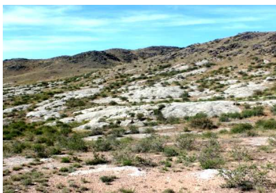
Figure 2. General view of Tyrnakty IPA

In the allocated site Niedzwedzkia semiretschenskia B. Fedtsch., which is the only representative of the family Bignoniaceae Juss. in natural flora of Kazakhstan, was noted. Niedzwedzkia semiretschenskia is the rarest endemic, highly decorative species of monotype order growing only in the South Kazakhstan in the east part of Chu-Iliyskiy mountains.