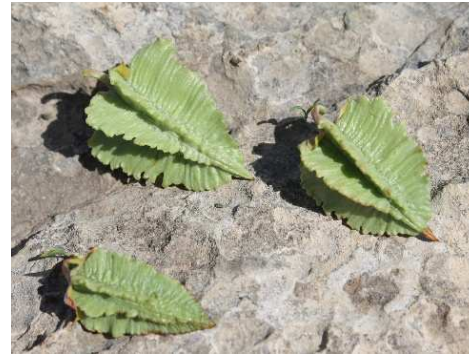
Figure 4. Fruit-bearing specimens of Niedzwedzkia semiretschenskia B. Fedtsch.