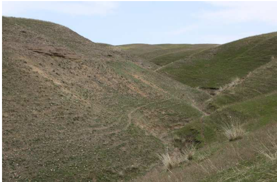
Figure 8. General view of Samsy IPA

almaatensis . It is necessary to continue studying this taxon in order to identify its systematic status.