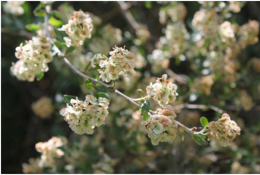
Figure 6. Atraphaxis muschketovii