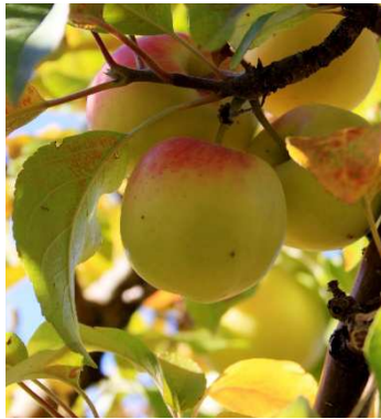
Figure 7. Malus sieversii

The high level of floristic richness with significant participation of rare and endemic species (criteria B) is intrinsic to IPA. Flora include a wide range of botanic-geographic elements. A big diversity of multispecies vegetation communities was recorded at loesses and boulder-cobble deposits of high and low piedmonts within the studied area (criteria C).