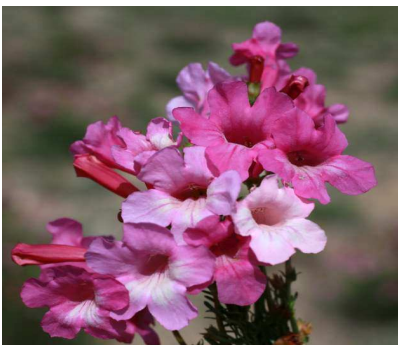
Figure 3. Flowering specimens of Niedzwedzkia semiretschenskia B. Fedtsch.