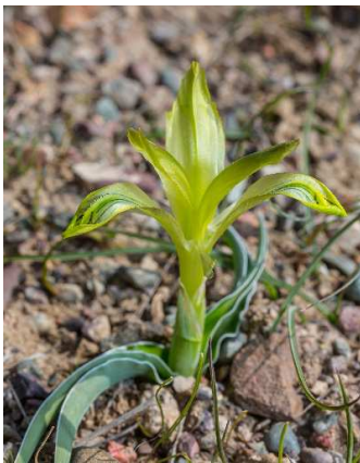
Figure 9. Juno almaatensis

One of substantiations for IPA identification was growth of other rare flora species. Five threatened endemic species listed in the National Red Data Books were recorded within the territory of proposed Samsy IPA (criteria A(iii) ) [4]: Crocus alatavicus , Iridodictyum kolpakowskianum , Juno almaatensis , Juno kuschakewiczii , Tulipa kolpakowskiana . It should be pointed out to exclusive participation of ephemers and ephemerooids (criteria B) in flora richness. The outcrops of conglomerates and their wind-blown rock slides and alluvial deposits with groupings of petrophytes are of certain interest.