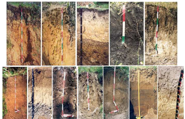
Figure 2. Spectrum of genetic profiles Georgia's soils.

Ferrous-manganous cutans, being the immediate product of illuviation, may be purely ferrous or manganese-ferrous. Often, they alternate with clay sinters. Purely manganese films, the manganese, easily recognizable by their black color with a metallic gleam, are rarer. Their typical forms are dendrites (fillers in thin, branched-out pores) and ferrous-manganese pseudomorphs on the vegetation remains.