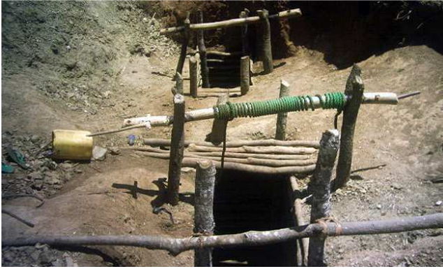
Figure 4. Haulage by using local simple pulley system, source MEM.