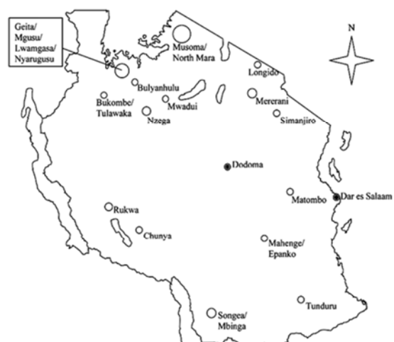
Figure 1. Various areas where mining activities are carried out in Tanzania.

Small scale mining in Tanzania is characterized by low productivity which is mainly a result of application of rudimentary and inappropriate technology which in turn impact on capacities to generate income. Is the kind of mining which involves the use of local or rudimentary hand tools such as hoes, panga, spades, buckets, etc in mining and processing of minerals. There are many possible methods to recover gold from ores; these include amalgamation, gravity concentration, leaching and flotation. This work focuses only amalgamation using mercury, a method that is on its onset application by small-scale gold miners in Tanzania. (Figure 1).