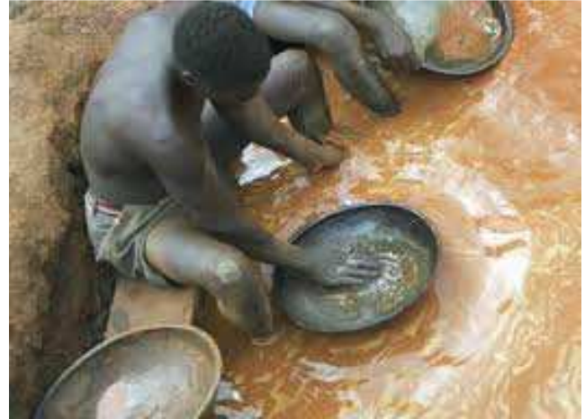
Figure 6. Small scale miners in Tanzania extracting gold by using mercury, source: Geocenter. dk.

Small-scale miners continue to use mercury for the recovery of gold without taking any protective measures despite danger to human health and the environment. The attraction of mercury is based on the fact that it is readily available, cheap and efficient in recovering fine-grained gold. (Figure 6).