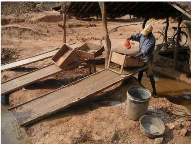
Figure 5. Small scale miner is recovering gold by leaching process, source: MEM.

A finely ground powder is then forced by water over the washing table covered by a beaten cotton sac. Being denser than other materials in the powder, gold will leach to the cotton sac and be recovered on later stages. The recovery of gold using this method is very poor, usually 30%, the other 70% going unrecovered as gold tailings. (Figure 5).