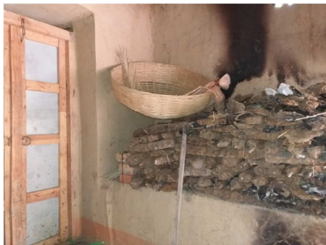
Figure 2. Cow dung made fuel kept inside the room.

Their house pattern is a major responsible factor. Santal people don't keep any window in their houses, because their ancestor used to do so. They keep their room dark and keep everything in the living room. So, sand fly and other insect can easily bite them.