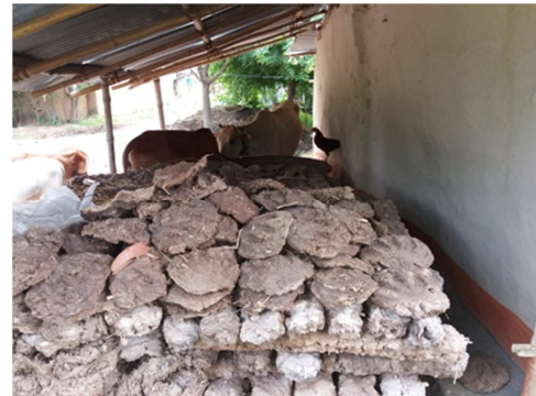
Figure 3. House surroundings are messy.

Both male and female works are day labor. So, no one left home to clean their house. One can found dust around the house. Location of their house is also important factor. They build their house next to jungle. That's make a safe place for sand fly.