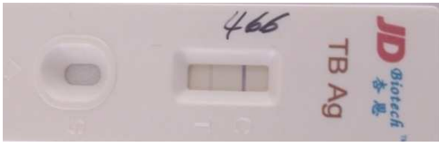
Figure 1. JD-TB-Antigen positive results.