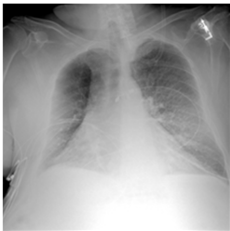
Figure 1. Chest radiography shows diffuse bilateral prominent interstitial lung markings.

glucocorticoids, antibiotics and inhaled bronchodilators. On arrival to the emergency department, he was found to be hypoxic and was placed on 5 Liters of oxygen via nasal cannula. On exam, he had bilateral wheezing. Chest x-ray (Figure 1) showed diffuse bilateral prominent interstitial lung markings, which were unchanged from a previous chest x-ray. The patient was later admitted to the hospital and started on IV glucocorticoid, doxycycline and aggressive pulmonary toileting with inhaled bronchodilators. In spite of these treatments, his work of breathing and hypoxia worsened, and he was placed on Bi-level intermittent positive pressure ventilation (BIPAP), eventually requiring intubation and mechanical ventilation. Upon further questioning of the patient's family, they reported that the patient was having difficulty swallowing solid food recently, and an event of choking on the steak was reported to have occurred the night before admission. Indeed, the patient reported to his family that he felt like a piece of meat was stuck in his throat. Bronchoscopy was performed for airway inspection, which revealed pieces of meat in the right main bronchus, which were removed with forceps (Figure 2). A follow-up bronchoscopy was done two days later which revealed some purulent secretions, however, did not show any endobronchial obstruction. The patient was weaned successfully from the ventilator and extubated. He was referred to the speech therapy team for a swallowing evaluation.