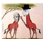
Mechanism of evolution

Darwin uses Lamarck's forth principles to explain how evolution occurs (as the mechanism of evolution) and moved back towards a more Lamarckian position. Nevertheless, Evidences are provided form his book the 'Origin of Species' and 'Descent of Man' as well as different biological text books: