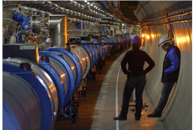
Figure 5. The first full LHC cell (~ 120m long): 6 dipoles + 4 quadrupoles; successful test at nominal current (12KA) M. Carena (Fermi National Accelerator Laboratory, 2010).

In 2010, T. Junk of Fermi National Accelerator Laboratory, proposed a computing model and the main aim of LHC is to smash protons moving at 99.999999% of the speed of light into each other and so recreate conditions of a fraction of a second after the big bang.