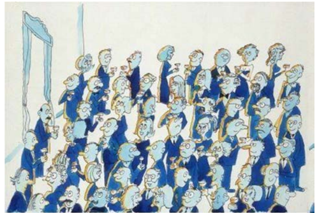
Figure 2. Illustration I.