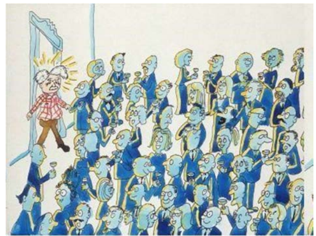
Figure 3. Illustration II.

From Figure 2 illustration I, a well-known scientist walk in, creating a disturbance as he moves across the room, and attracting a cluster of admirers with each step.