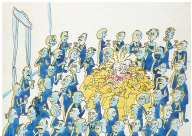
Figure 4. Illustration III.

This increases his resistance to movement, in other words, he acquires mass, just like a particle moving through the Higgs field. If a rumour across the room, it create the same kind of clustering, but this time among the scientists themselves. In this analogy, these clusters are the Higgs particles.