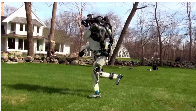
Figure 4. American mobile robot security guard Atlas with adaptive behavior.