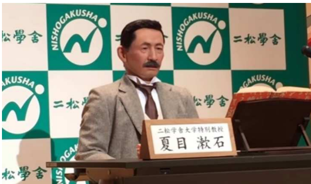
Figure 3. Japanese robot lecturer on literature.