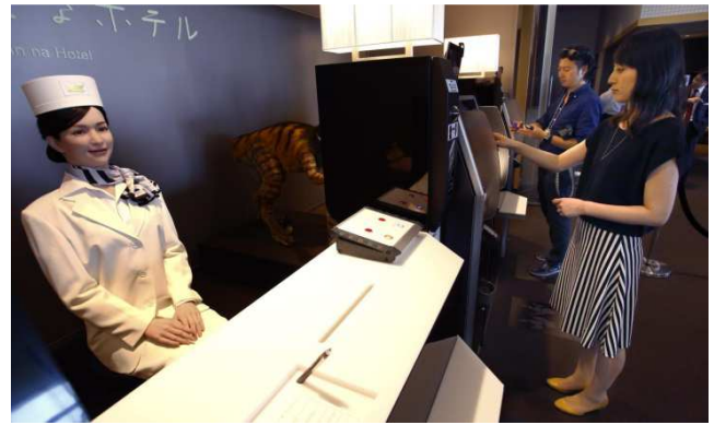
Figure 5. Japanese robot-administrator of hotel Henn-na Hotel.