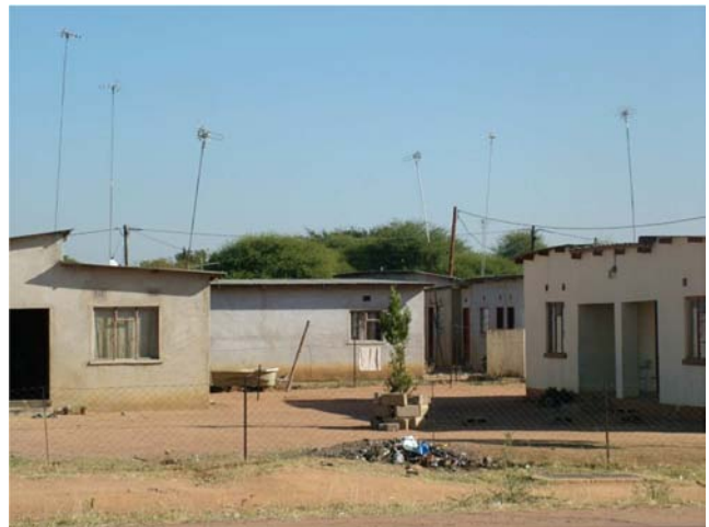
Figure 3. Typical buildings in developing countries with ungrounded metal roofs and metal protrusions such as television antennas. In the event of a lightning strike to the roof or protrusion it is highly possible that a side flash (or multiple side flashes) will leap to the body of occupants of such shelters.

Our investigations of lightning accidents in many developing countries show that side flash is the predominant mechanism of injury, with most of those reported being fatal and often occurring because people are attempting shelter inside insubstantial buildings. This could be because non-fatal incidents or those involving only one person are not newsworthy enough to be reported either by the media or to government authorities. The most probable outdoor scenario of side flashing from tall trees; whereas indoors, side flashing often occurs as arcing from a metal roof which has no or poor grounding (Figure 3).