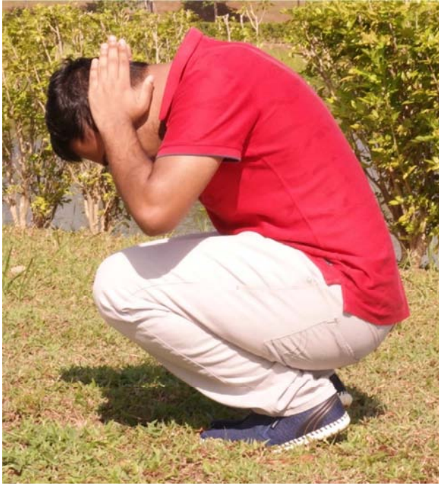
Figure 4. Lightning crouch: feet close together, low height, preferably with hands over ears.

be tiptoed, in practice, it is not that convenient to be in such stance for more than few tens of seconds. Furthermore, a person in such posture may find himself off-balance and topple over the toes. As discussed earlier as well, although this posture is proposed in several safety guidelines, it is no longer taught in some developed countries due to the ready availability of safer places to a majority of the population over most of the time.