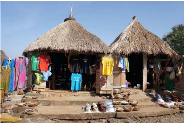
Figure 1. A commercial structure where many people could be taking shelter during a sudden thunderstorm. This is a typical sheltering structure for both housing and other use, in developing countries, which involve wooden or mudbrick walls with a combination of flammable thatch and wooden roof, often held down by stones. Components of the entire structure and its contents are inflammable.

When lightning affects a human being, injuries may range from simple tingling and muscle aches to cardiac arrest, brain injury, nervous system damage and death [19]. While few in developed countries suffer from serious burns, the same may not be true in developing countries where kerauno-paralysis, temporary paralysis from lightning lasting minutes to a few hours, may prevent even healthy individuals from escaping homes or work places where dry thatched roofs (Figure 1) have been ignited [19].