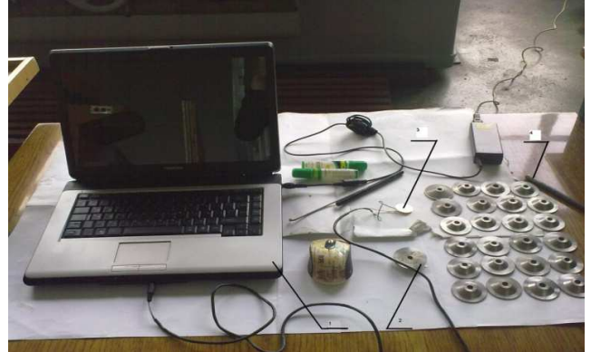
Fig. 1. The general view of the experimental setting.

conditions for maintaining the competitiveness of products is the use of resource-saving production processes, one of the promising directions is the application of non-destructive method of control based on the gain-frequency characteristic and creation of a new control system of simultaneously various detail parameters (quantitative and qualitative).