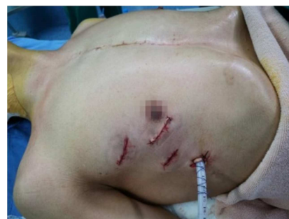
Figure 2. Puncture of the right femoral vein.

Conventional drugs for extracorporeal circulation, rescue drugs (epinephrine, deoxyepinephrine, magnesium sulfate, calcium gluconate, lidocaine, sodium bicarbonate, potassium chloride) and cardiac arrest fluid. (2) Heparin sodium, the dosage of which is 1:1 based on body weight, is different from the conventional body circulation dosage; Heparin, it is based on body weight 1:3.5 (Figure 2). (3) Protamine neutralizes heparin sodium, and its dosage should be 1.5:1; (4) electrophysiological mapping was used to induce ventricular fibrillation (0.25mg isoproterenol plus 250ml normal saline).