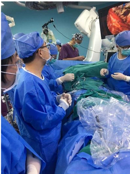
Figure 3. Cardiac surgery.

After radiofrequency ablation of atrial flutter, the surgical nurse provided the valve forming suture line to cooperate with tricuspid valve forming. The nurse is responsible for the preparation of ring detectors and artificial rings before surgery. Before opening the artificial valve ring of high-value consumables, the surgeon, instrument nurse and circuit nurse shall jointly check the model, brand and validity period. 36-37°C normal saline 1000ml-1500ml was prepared to test the tricuspid valve forming effect after completion of the forming operation (Figure 3).