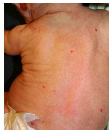
Fig. 1. Cutaneous manifestations of multiple hemangiomas in our patient.

hemangioendothelioma and abnormal values of TG was reported, he was referred to our hospital for further evaluation. Abdominal ultrasound (US), were consistent with multinodular hepatic hemangioendothelioma (HHE) (Fig. 2 A), Echocardiography showed Foram ovale apertum, cardiomegaly with hyperkinetic circulation , brain US with normal findings. Investigations showed sub-clinical hypothyroidism: TSH 10 mIU/l, (0.58-5.57); fT4: 23.77 pmol/l (12.8-44.3); T4: 177.89 nmol/l (77.9-235.1); T3: 1.11 nmol/l (0.39-4.0); TG: 53.57 \mu\text{g/l} (7.4 - 48.7).