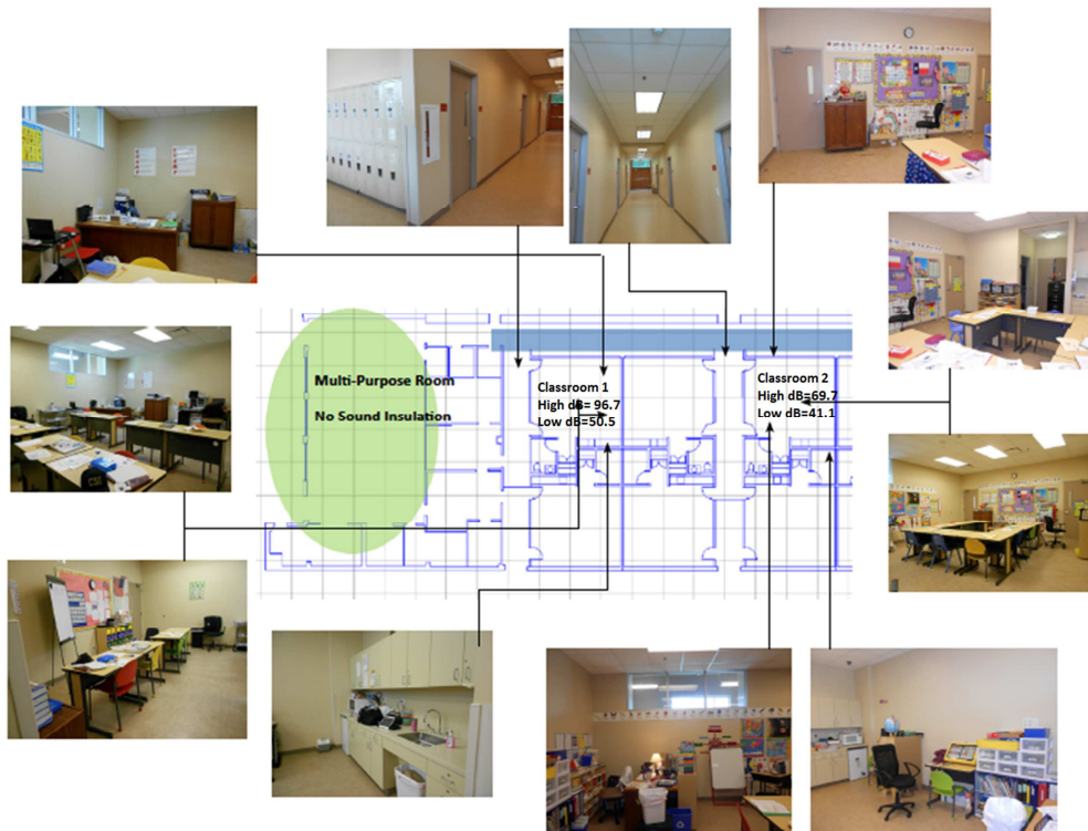
Figure 2. School 2 layout and images. 3