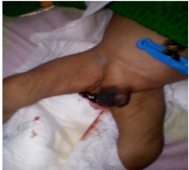
Figure 1. Rectorrhagia.

Feeding was momentarily stopped, a siphoning nasogastric tube and oxygen were placed, Antibiotic therapy was switched to Imipenem: 60mg/kg/24h twice daily, Amikacin: 15mg/kg/24h and Metronidazol: 30mg/kg/24h thrice daily. Vitamin K1 was administered at 1mg/kg/24h for 3 days. Caloric needs were estimated at 120kcal/kg/24h, with amino acids: 3g/kg/24h = 154 Kcal, lipids 3g/kg/24h, Dextrose 12.5%: 18g/kg/24h + Ions = 130 Kcal. Gastric protection was by Omeprazole 1mg/kg/24h. Vital parameters, gastric secretion, diuresis and stool were followed-up.