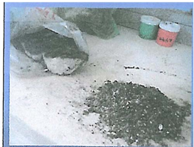
Fig. 2. An example of the scales sample.

The sediment samples (sludge, scales) were dried in an oven at 105°C for 24 h, crushed and sieved by 1mm sieve to remove mechanical waste. Then, the samples were weighted and packed in cans (100 cm 3 ) for six weeks to reach secular equilibrium where the rate of decay of the progeny is equal to that of the parent. The water samples were acidified with 20 mm of hydrochloride at the rate of 20 ml as soon as possible after sampling to prevent adsorption of radio-nuclides in the bottles.