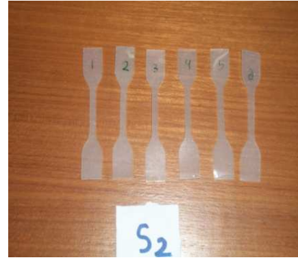
Figure 1. Sampel for tensile test with a mixture of PVA and ZnS nanoparticles (PVA: ZnS); S1 (100:0)% and S2 (99:1)%.

Shown in Figure 1.variation of each sample was made 5 pieces to get a more accurate result and the results averaged measurements taken. Sample S1 with only PVA (ZnS nanoparticle 0%) have clear and transparent colors. Sample S2 with a mixture of PVA and variations ZnS nanoparticles (99:1)% has a white color somewhat darker than the sample S1. With a mixture of 1% ZnS nanoparticles have shown differences in terms of color samples, as well as for samples with a mixture of PVA and ZnS nanoparticles (98:2)% , (97:3)% and (96:4)%. They have more white color and not transparent. This is due to the amount of nanoparticles are mixed more and more.