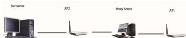
Figure 3. A snapshot of the proposed procedure.

In our proposed procedure instead of using an access point (AP), we use from two (AP) accessing points, in this way that the first AP (AP1) which is connected to the proxy server is coded by using of WPA protocol and TKIP algorithm and the next AP, i.e. AP2 which is between Proxy server and the network server, is coded by using of WPA2 protocol and AES algorithm. In northern figure 3, this procedure has been shown.