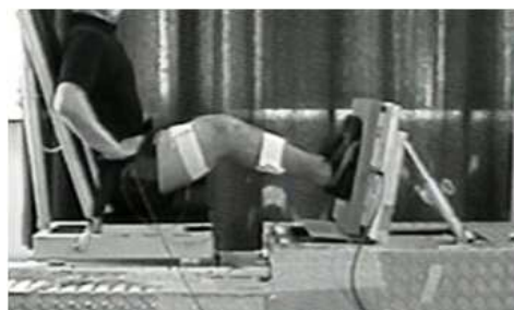
Figure 1. The multi-joint isokinetic dynamometer

were sitting comfortably on the seat of the isokinetic dynamometer placing their legs on a force-plate while their chest and hips were stabilized with straps (Figure 1). During the eccentric exercise sessions the knee joint range of motion was set between 130^\circ to 160^\circ and the linear velocity was set at 0.35 m/s. The first week of the training period served as familiarization period using 70% of the maximal eccentric performance [18-20]. The intensity of the follow up sessions was constantly controlled and readjusted by performing regular assessments of maximal eccentric performance (Table 1). Before each exercise session, subjects performed a warm-up consisting of 6-min cycling on an ergometer at 70 rpm and 50 W followed by 5 min of ordinary stretching exercises of the major muscle groups of the lower limbs.