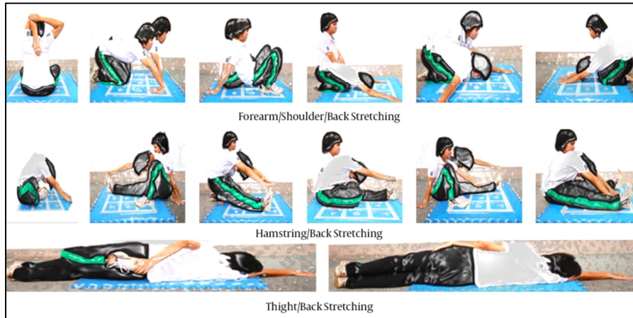
Figure 1. Stretching Exercise on the Plate in NME Program.

During the sessions, the instructor constantly monitored the older adults and corrected their body positions, joint angles, direction of movement, form- to-form transitions.