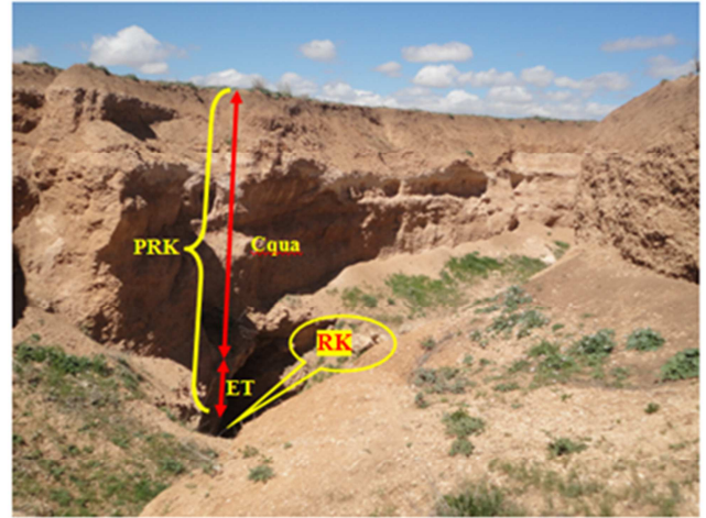
Cqua: Mio-Plio Quaternary filling deposits PRK: Cavity depth RK: karst cavities ET: Roof thickness