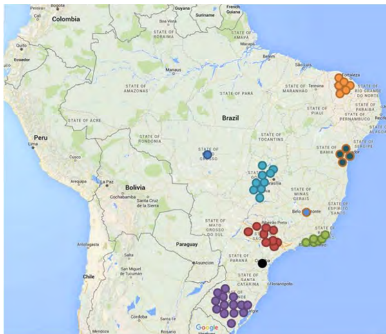
Figure 1. Brazilian map with highlights of the places the social movements took place in Brazil.

The SSM described in this study occurred in nine different states in Brazil. The first started in São Paulo, in October 2015, and the last one in May 2016. The SSM involved occupation-type protest, as defined by Pickerill and Krinski [21], and demonstrations, using Facebook as a communicative tool. Figure 1 depicts the places in which the SSM took place. We will refer to the SSM by the name of the state they occurred, except the ones from São Paulo, since three different SSM took place there. Below, we briefly summarize the SSM of every state.