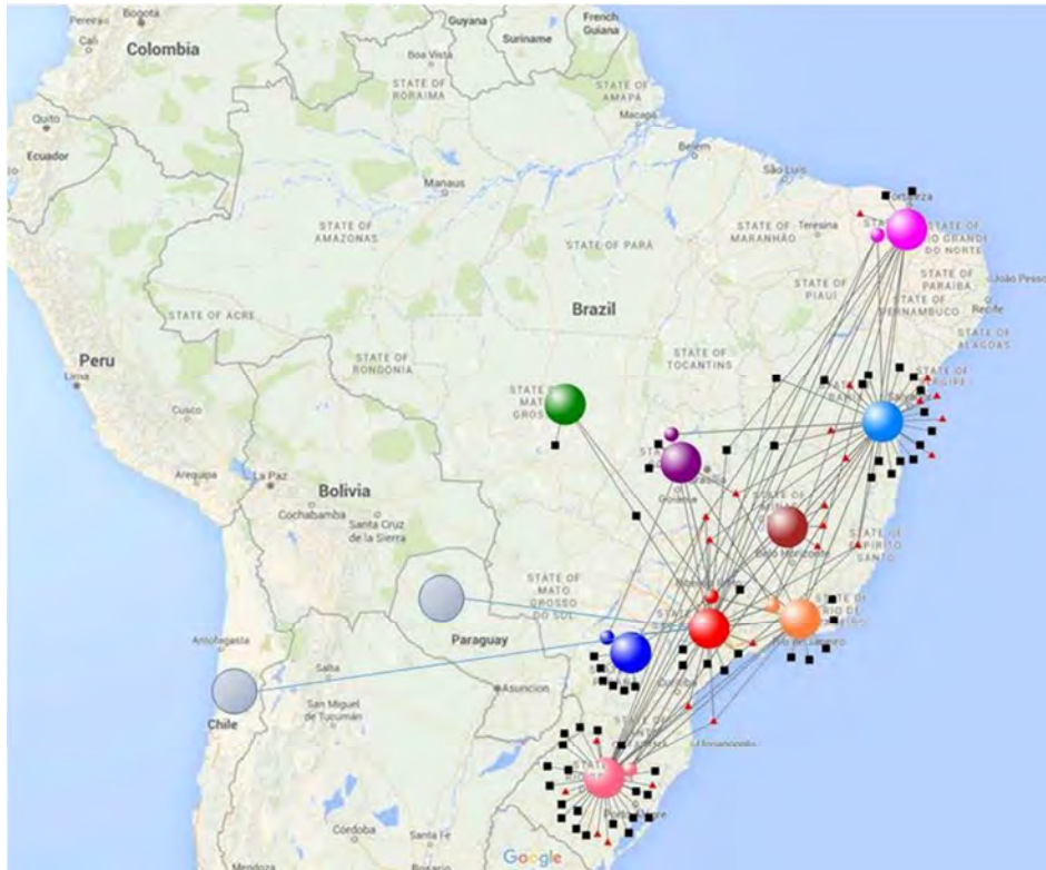
Figure 3. Links and relationships among the pages on Facebook of the students' social movements.

The network analysis demonstrated that the SSM from São Paulo had a more central position in relation to the other states. However, we represented the network based on the geographical position of each state on the Brazilian map, and not as a traditional harel-koren fast multiscale graph. That could also be confirmed by the number of times the other SSM referred to São Paulo's page (thirty-nine) and by the number of posts it shared from other SSM (sixteen).