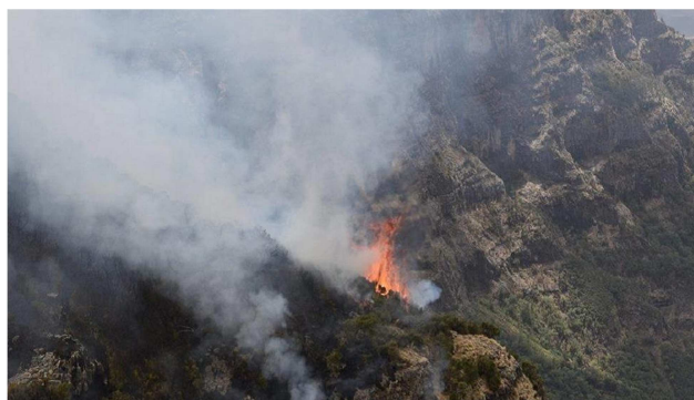
Figure 2. Semien National Park, Africanews (2019).

The current policy projection result of ‘Climate Action Tracker’ 5 shows that Ethiopia became one out of countries that have long term targets and short term policies to limit the warming by 1.5°C by minimizing deforestation scale, and maximizing the forestation and reforestation measures. However, the Ethiopia government commitment is not at all consistent with the Paris Environmental Agreement (1.5°C). Therefore, if the Ethiopia government measures goes similar with the current trend, then by the 2025 the country’s warming would increase by 3-4°C. This shows that the country’s environmental policy and practice lacks important aspects (implementation and policy gap) that prevent the country’s GTP II from the realization and the 2025 green transformation will be impacted highly. As a result, the country’s environmental visibility became associated highly with the political significances at international arena and domestic political affairs.