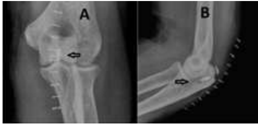
Fig 4. The post operative anteroposterior (A) and the lateral radiograph (B) of the elbow of the patient who underwent repair of the bony avulsion of the triceps. The triceps was repaired using the anchors (arrow head).

limbs were then passed in the triceps tendon in a locking loop stitch configuration.