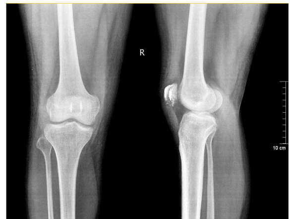
Fig 3. AP and lateral radiographs depicting the repair of patella to the patellar ligament with anchors

Two patients underwent excision of the comminuted inferior pole followed by repair of the extensor mechanism using Fast Fix Anchors (Smith-Nephew)-3.5mm titanium anchors (Fig 3).