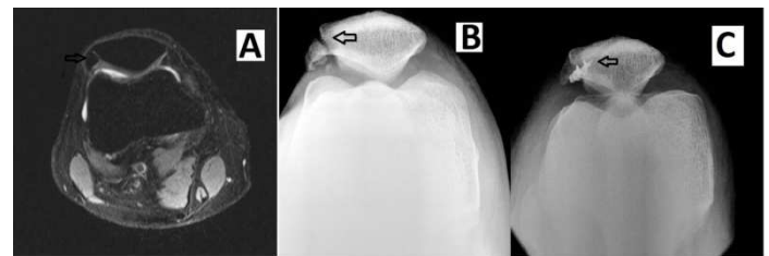
Fig 6. MRI image (A) and the axial radiograph of the knee (B) showing a symptomatic bipartite patella (arrow). The post operative axial radiograph of the knee (C), after the excision of the symptomatic bipartite patella and reattachment of the quadriceps.

She underwent arthroscopic excision of the symptomatic bipartite patella followed by open repair of the quadriceps. The arthroscopic removal of patella resulted in a deficiency of the attachment of quadriceps which was addressed by open means. The 3.5mm anchor was placed laterally (fig 6) in the upper portion of patella and the quadriceps was repaired with the help of free suture limbs. Patient was immobilized for 2 weeks followed by gradual mobilization. Patient had complete recovery of her range and strength by 8 weeks post surgery. This was maintained at 6 months and 2 years post surgery.