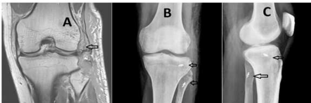
Fig 1. Traumatic avulsion of the lateral collateral ligament and capsule (A) of the knee as indicated by the arrow. The anteroposterior (B) and the lateral radiograph (C) of the knee showing the repair of the collateral ligament and reattachment of the cap.

Twin Fast 3.5 mm Ti (Smith and Nephew) was used to fix the free ends of the fibre wire into the lateral epicondyle of femur under adequate tension (fig 1). In the second case the lateral collateral ligament was repaired in the above mentioned fashion and it was reinforced by taking a portion of the biceps femoris with its distal attachment left intact. Patients were placed in a hinged knee for 4 weeks followed by gradual mobilization. Patients had complete recovery of range of motion and strength at 12 weeks post surgery. Patients were subsequently see at 6 months and then again at 2 years post surgery.