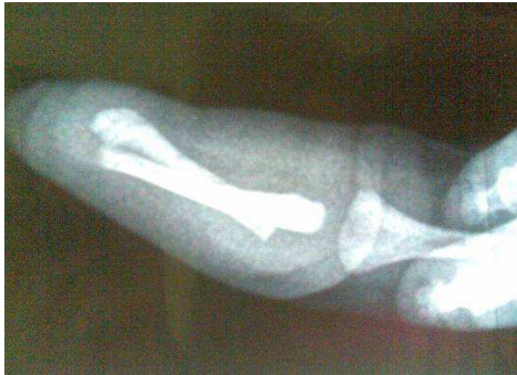
Fig 4. Absent left carpal bone and wrist, the radius and ulna are present and normal