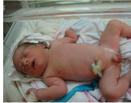
Fig 5. Total absence of the left hand from the level of the wrist joint, and there is remnant of fingers at the end of the forearm

Radiological examination showed absence of left carpal bones and hand, and also absence of left Radius (left radial hemimelia) (fig 6).