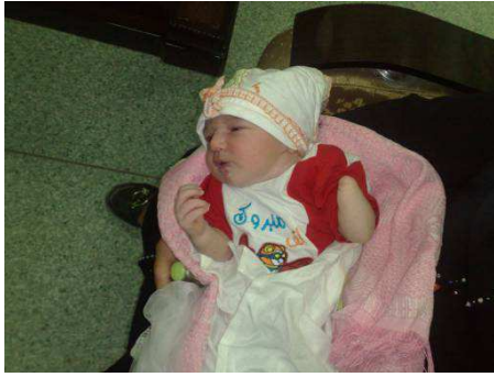
Fig 3. Absent left hand from the level of the wrist joint