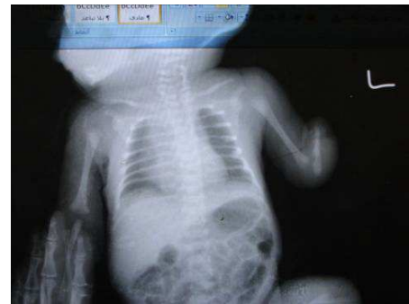
Fig 6. Absence of left carpal bones and hand, and left radial hemimelia

Chromosomal study for the 3 cases was done and revealed no abnormality (fig 7,8,9).