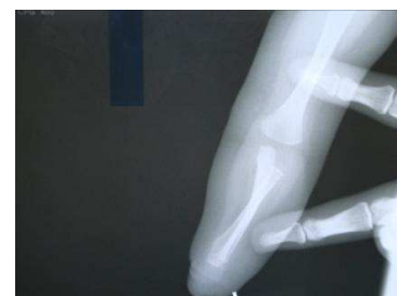
Figure 2. Absent left carpal bones & hand