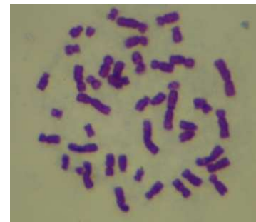
Fig 7. Case 1 chromosomal study

Chromosomal study for the 3 cases was done and revealed no abnormality (fig 7,8,9).