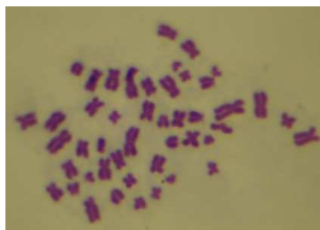
Fig 9. Case3 chromosomal study