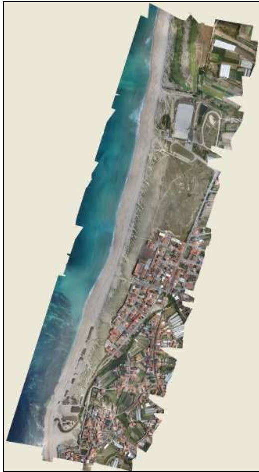
Figure 7. Orthophoto of the Aguçadoura beach (2014).