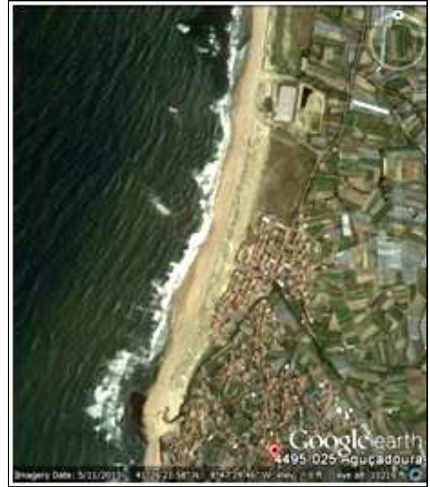
Figure 2. Aguçadoura beach.

The Aguçadoura and Ramalha beaches are the famous tourist destinations. located in the city's rural outskirts, Aguçadoura is the best surfing beach of the city of Póvoa de Varzim, with a large dune area, making it the longest beach in Póvoa [8]. Ramalha beach also displays a very extensive sand and well preserved dune system [9].