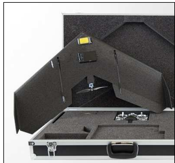
Figure 3. The swinglet CAM with the camera Canon Ixus 220 HS onboard.

We conducted several field works. Goals of our field works were to study the present geoeological conditions of the Portuguese north-west coastal zone by using the traditional surveying methods and by applying the latest research method of close-range digital photogrammetry.