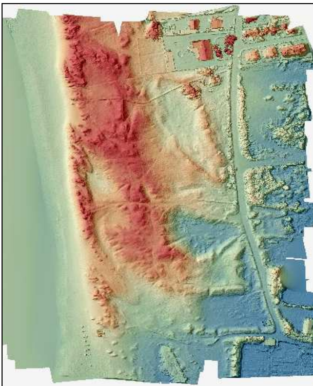
Figure 8. DEM of Ramalha beach (2014).

At this stage of study, we derived the above product without using the ground control points, or we used only the camera GPS data. For the case of Aguçadoura the accuracy of the altitude or the z-value is 2.8 meters in average and that of the pixel is 0.6 in average (Figure 10). We visualized the models in the GISs software and checked the relief heights there. The same accuracies had the Ramalha beach models.